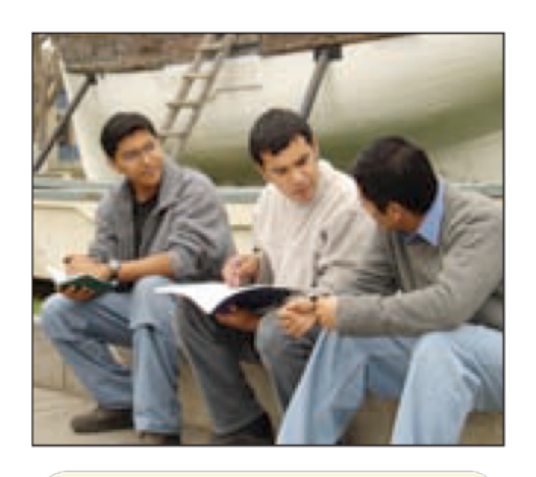
nosotros, vosotros, ellos