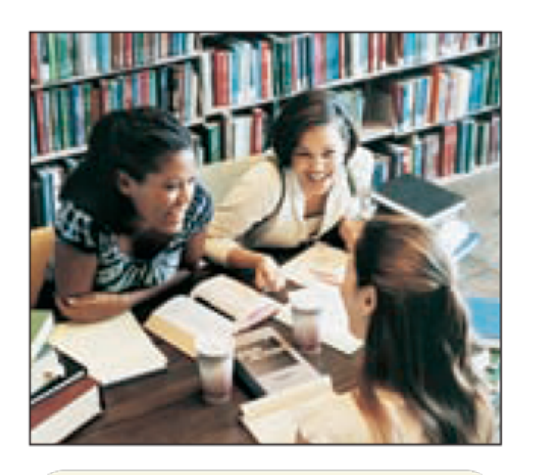
nosotras, vosotras, ellas