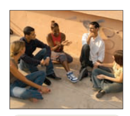
nosotros, vosotros, ellos